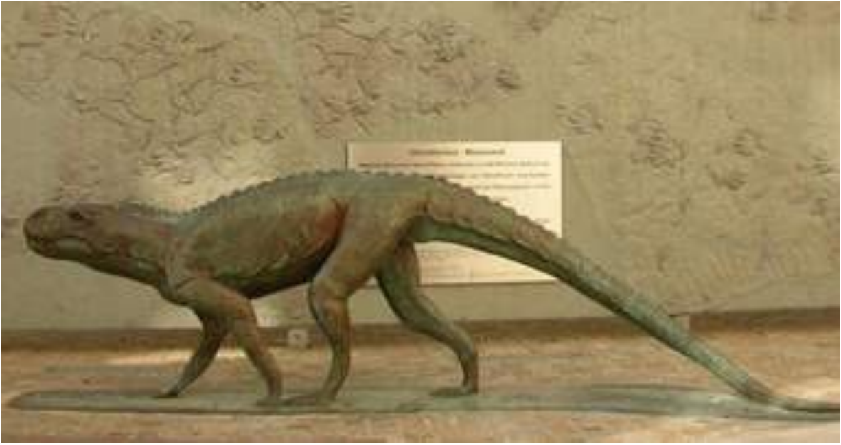
Chirotherium (Cheirotherium) www.topontiki.gr